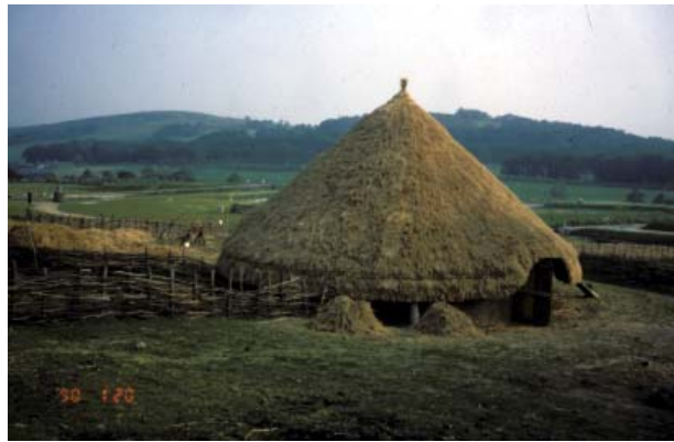
Iron Age farmstead, Archaeolink