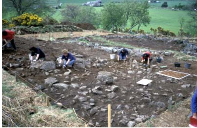
Excavating hut circle at Archaeolink