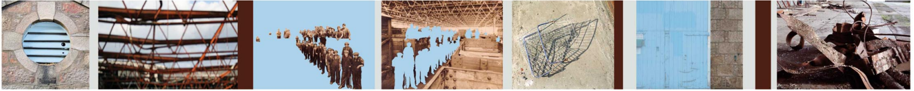
'Missing in Action: Locoworks' Catriona Forsyth/ Susan T. Grant Digital photographic duratrans on lightboxes

The culmination of the unique arts and wellbeing project 'Pathways', art on referral' is to be celebrated with an exhibition at Inverurie Health Centre to be launched by The Minister for Tourism, Culture and Sport.