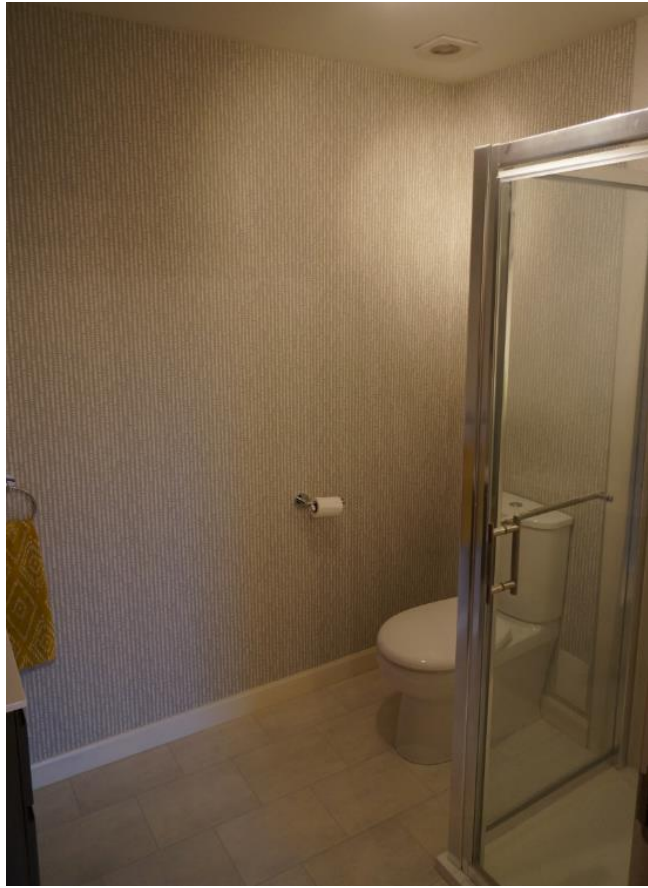
Downstairs Shower Room