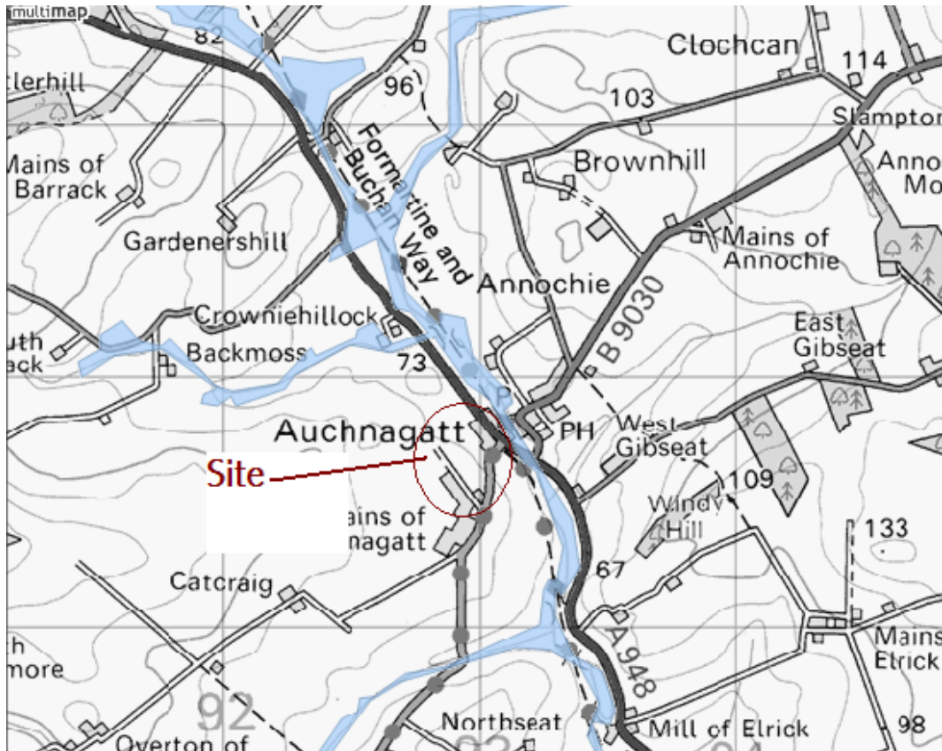
Figure 4: SEPA Flood Map

We enclose an extract from the SEPA 1: 200 year storm flood maps. As can be seen from this the site is not subject to flooding. See figure 5 below.