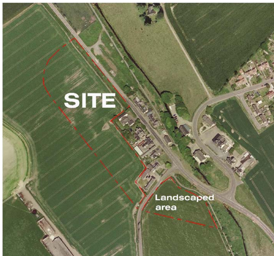
Figure 2: Site Plan

The Auchnagatt site is located to the west side of Auchnagatt, off the A948. The site is in single ownership and comprises of fields currently used for agriculture, one being very stoney in nature and of little agricultural use. The site subject of the development bid is identified in figure 2 below.