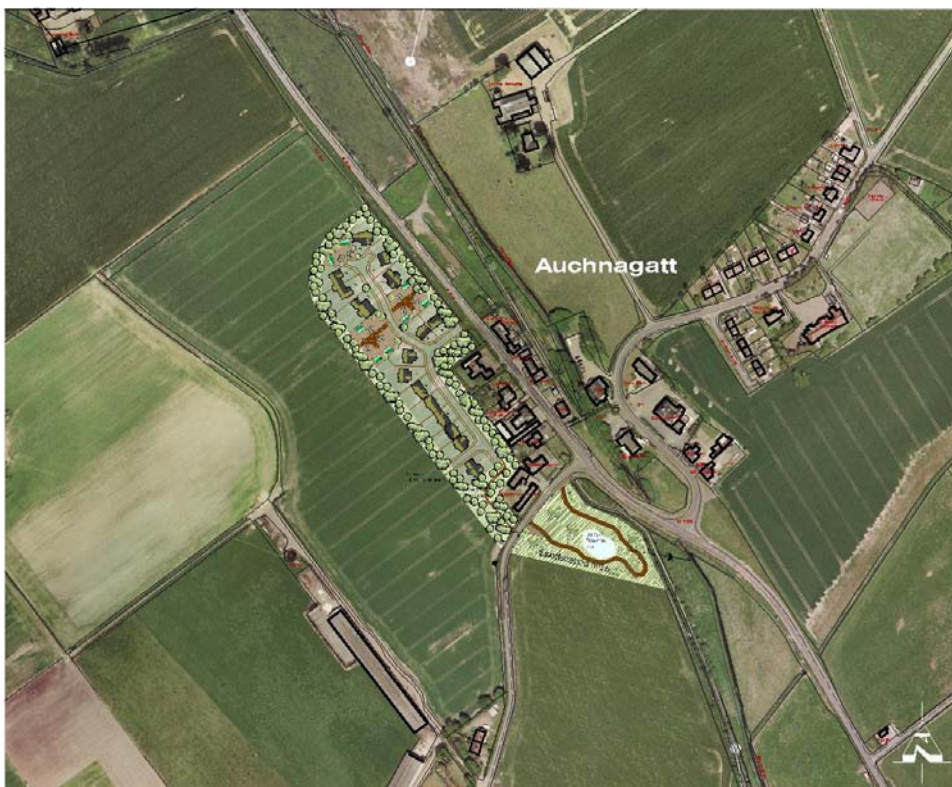
Figure 3: Masterplan

The proposed development allows for approximately 15 houses to be added to the village of Auchnagatt, taking access from the A948. The development will incorporate some business units which will be integrated in clusters within the proposals (see business unit detailed plan). It would also be our intention to have a minimum of 25% affordable housing and to encourage the use of locally supplied sustainable materials. Due to the fact that there are no public sewers in Auchnagatt, we would propose our drainage system in the field to the south east of the development that will become a landscaped area/SUDS area/drainage area. This area is adjacent to the Buchan and Formartine railway, which would give good cycle/footpath links to the development.