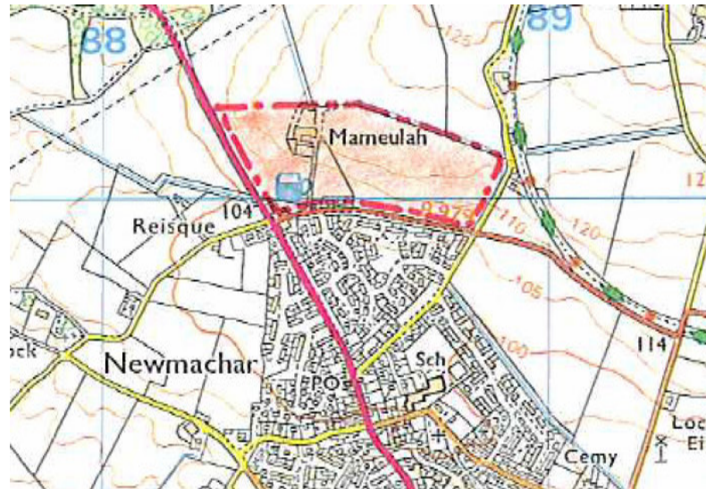
Figure 1: Location Plan

2.2 The settlement enjoys good road and public transport connections with Dyce and Aberdeen City. It also has an excellent footpath and cycle link with Dyce and Ellon to the north east, via the Formartine and Buchan Way. This utilises the solum of a redundant railway and provides a route to the City free of vehicular traffic.