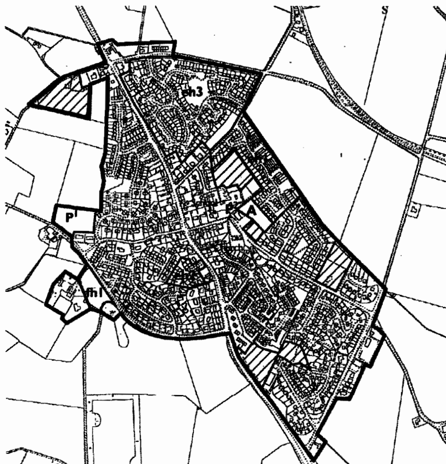
Figure 2: Local Plan Extract