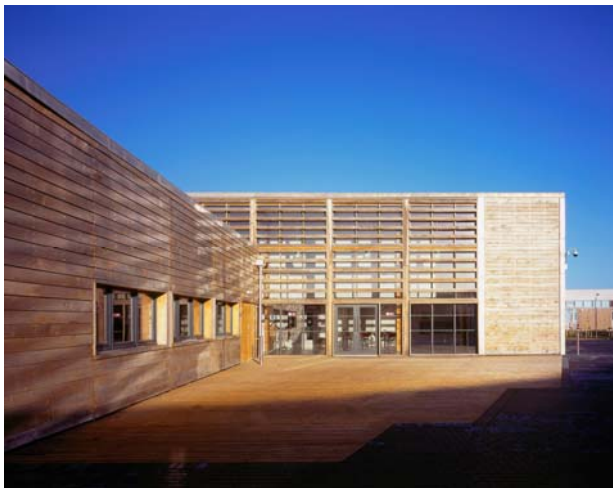
Lauder College, Dunfermline

Timber is a primary construction material, and in terms of sustainability it is one of the best. It is renewable, it requires little in the way of energy to make the transformation from living tree to usable timber, and in North Scotland it is grown and processed locally. The timber industry has always been a key part of the economy of northern Scotland. This is reflected in construction techniques dating back centuries. Timber is now being used in contemporary situations and a number of local companies involved in construction are already familiar with the benefits of using timber, and possess the skills needed to make best use of timber as a construction material.