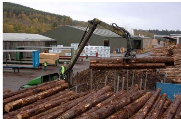
James Jones Sawmill, Aboyne

A list of processors and stockists and their contact details is provided in Section 7. Those listed stock home grown timber. Some timber kit manufacturers use home-grown rather than imported timber. In many instances timber kits will contain elements of home-grown timber as a matter of course, but usually there is no distinction made between home-grown and imported timber in such kits. Indeed much timber from North Scotland ends up in timber frame kits used for housing south of the border, while a large proportion of the timber used for timber frame homes in Scotland is imported.