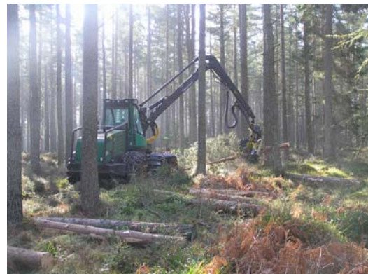
Seafield Estate, Cullen

per year. It is envisaged that 60% of this would be softwood production forests.