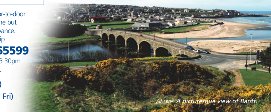
Above: A picturesque view of Banff.

Elgin: The capital and commercial centre of Moray. A former Pictish province, steeped in history and home to Scotland's only Biblical Garden.