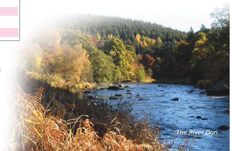
The River Don