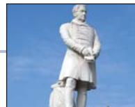
Photos from top: The old harbour Portlethen; Stonehaven harbour; Joseph Hume statue in Montrose