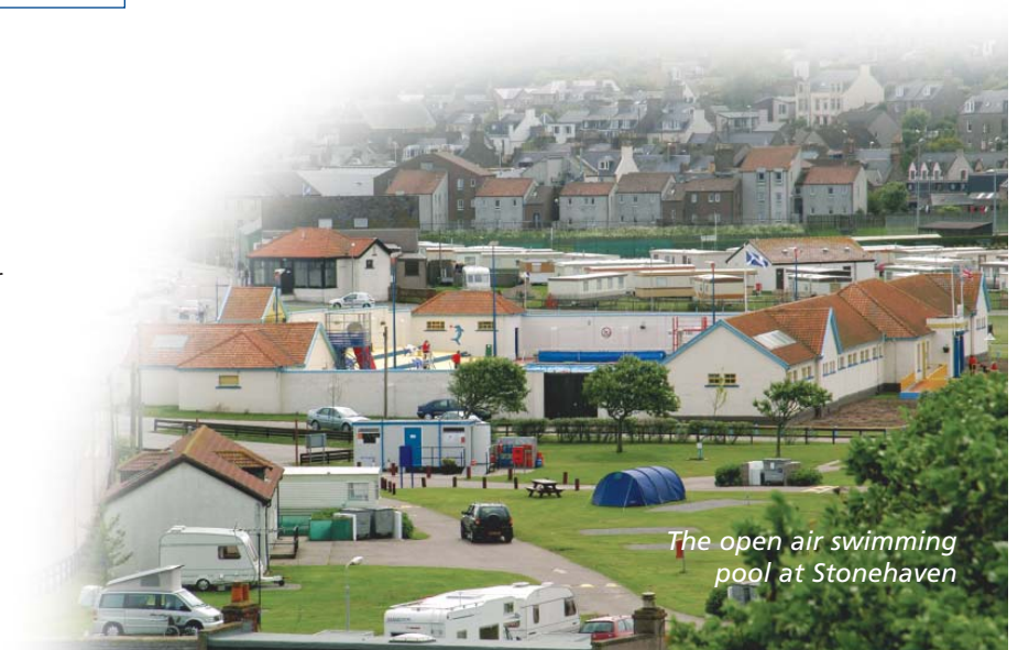
The open air swimming pool at Stonehaven

For further information check Aberdeenshire Council's website or call us on Stonehaven (01569) 765765.