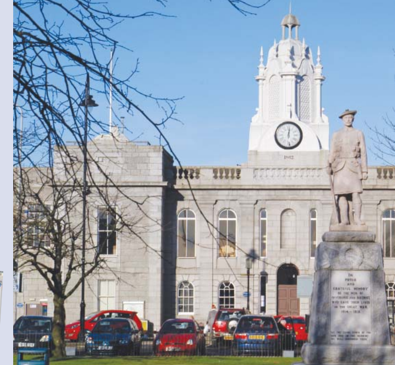
Inverurie Town Hall

Aberdeen-Inverurie-Inverness North Services