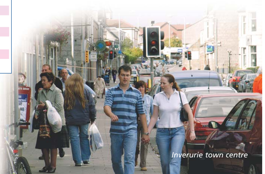
Inverurie town centre

Inverness: The capital of the Highlands.