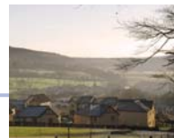
Photos from top: Inverness Castle; Elgin Cathedral; Huntly town square; Inverurie Town Hall; view over Blackburn, Aberdeenshire