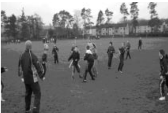
Action from the Garioch Festival at Kellands Park, Inverurie.

The requirement to travel to Inverurie was also established as a barrier to after school participation and GRC and AS have worked together to create local satellite clubs to increase participation levels. These now take place after school one night per week in each network and are aimed at P4-7. The hope is that participation in these local clubs will develop into additional participation at junior club level.