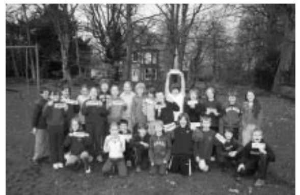
Pupils at Daviot Primary receiving match tickets