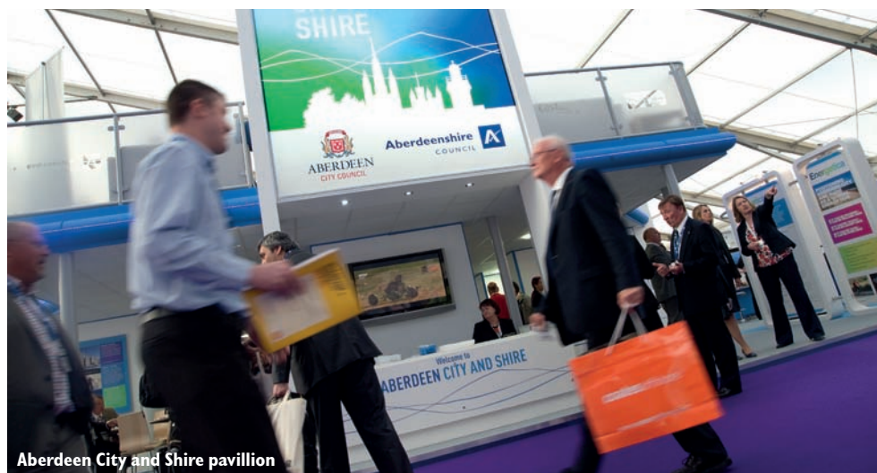
Aberdeen City and Shire pavillion

The stand also hosted a series of well-attended international seminars focusing on helping local companies expand their business to business links in Northern Norway, Western Australia and Brazil – the top three target markets identified by local companies in the 2010 Aberdeen City and Shire Export Survey.