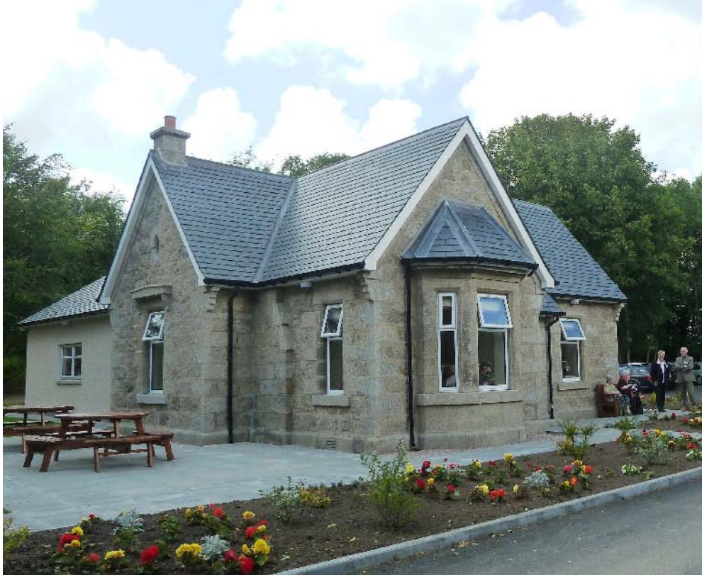
The Lodge, Strichen Community Park

Strichen Community Park Company purchased a derelict site in 1996 with financial assistance through the Scottish Land Fund to develop a community amenity.