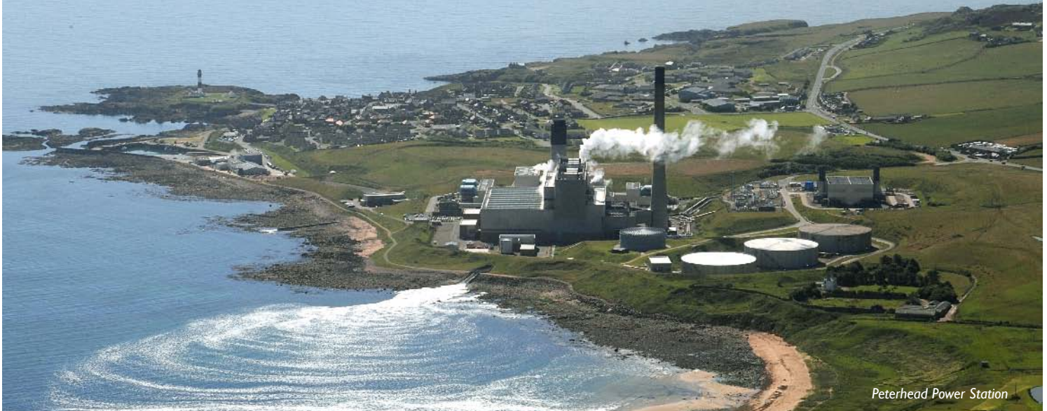
Peterhead Power Station

S cottish and Southern Energy (SSE) has applied for EU funding to develop carbon capture and storage (CCS) at its gas-fired power station at Peterhead.