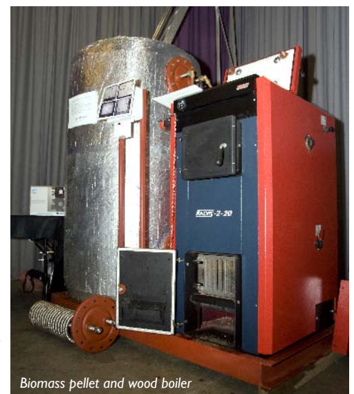
Biomass pellet and wood boiler