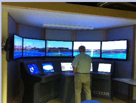
The simulator in action

For more information contact Linda Hope on 01346 506015 or email lhope@banff-buchan.ac.uk