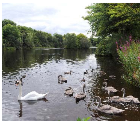
Strichen Community Park

The project is supported by Big Lottery, LEADER and Aberdeenshire Council.