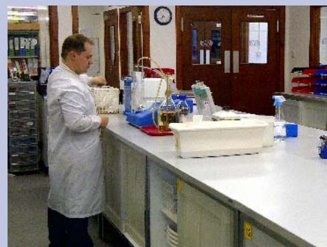
Sample analysis underway in SMS's laboratory

A full listing of the services provided by SMS can also be found on their website, www.sms-ltd.co.uk . If a test is required that is not listed, contact SMS as they