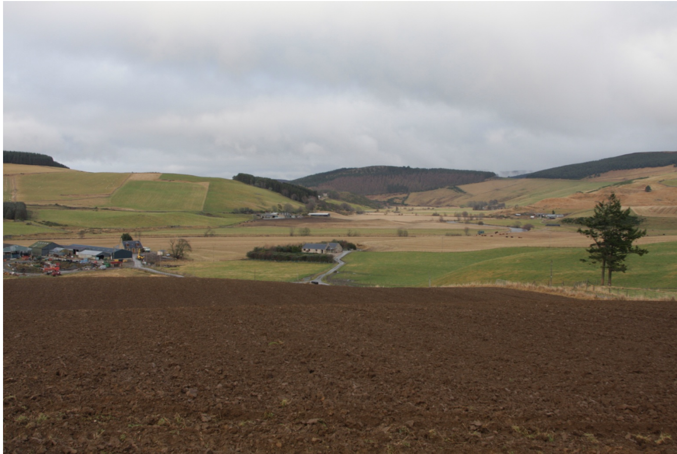
25(iii) Donside – In the wider sandstone valley fields are regular, smooth with few field boundaries and a regular pattern of farms