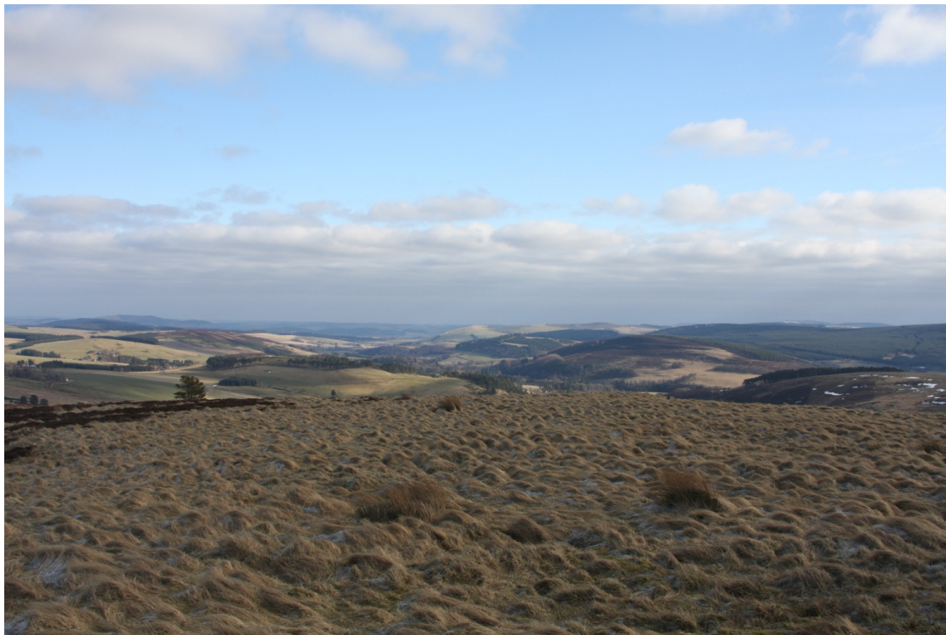
25(i) A view down the upper Deveron strath towards Huntly, showing the narrow profile and the higher moorland surrounding it.

Deveron and Bogie Strath is smaller in scale in the south and west and this part of the valley has a steep profile before it broadens out into a gentle strath north of Huntly. This valley is sandwiched between steeper surrounding moorland and there is a grand sense of scale. Land use is predominantly agriculture with a network of roads and settlements adding to the mosaic.