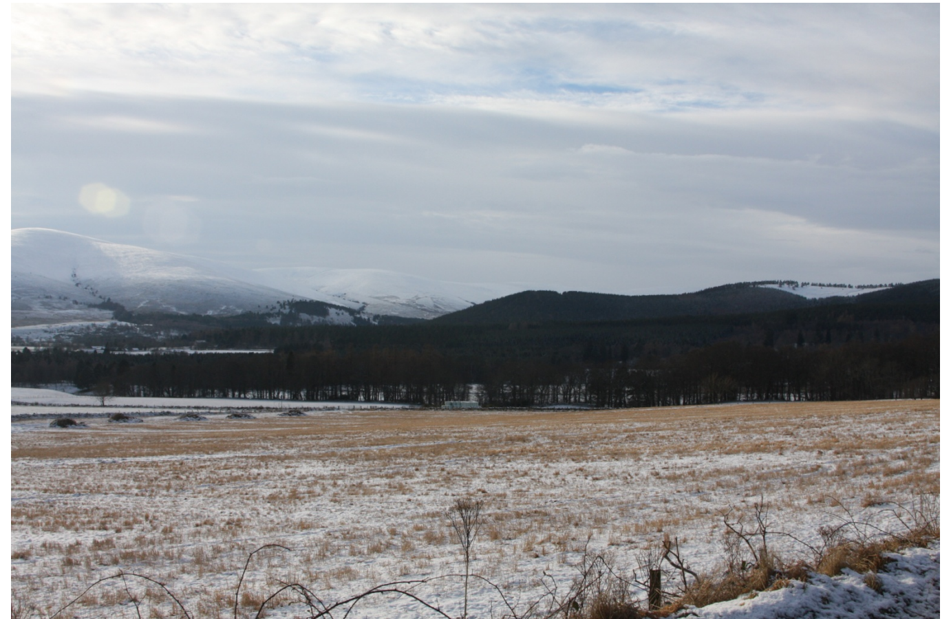
25(ii) Deeside has a strong pattern and thick broadleaved woodlands clothe the valley sides.

villages such as Banchory and Kincardine O'Neil. It was the traditional transport route from Aberdeen into the heart of the Grampians. It is a highly scenic landscape of broadleaved woodland, numerous estates with fine buildings and grand gatehouses, together with long avenues of Beech trees. There are numerous HGDLs, castles, tourist routes and long distance footpaths.