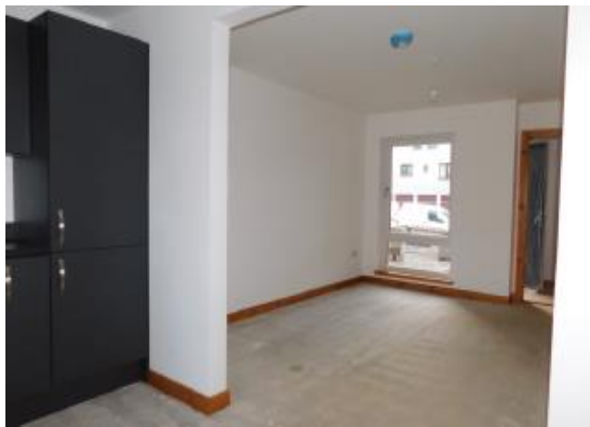
Open Plan Living Room / Kitchen