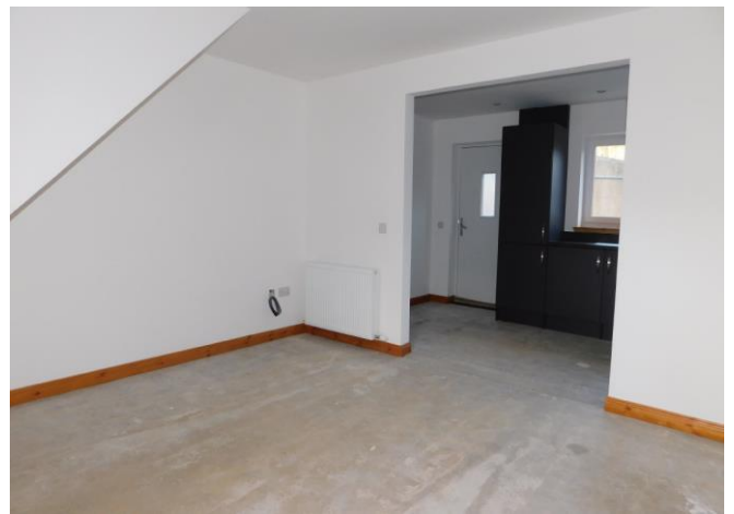
Alternative View of Living Room / Kitchen