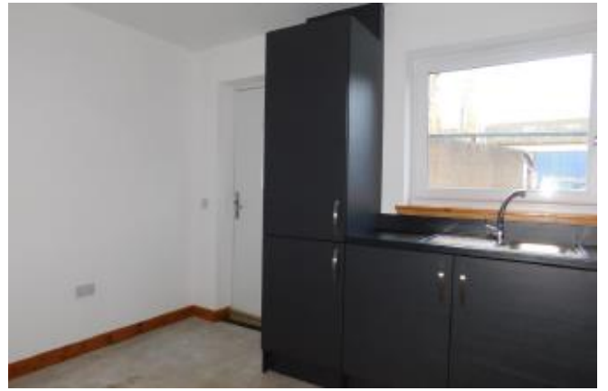
Alternative View of Kitchen