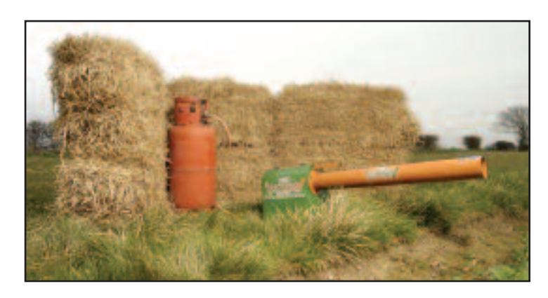
Auditory scarer with baffles