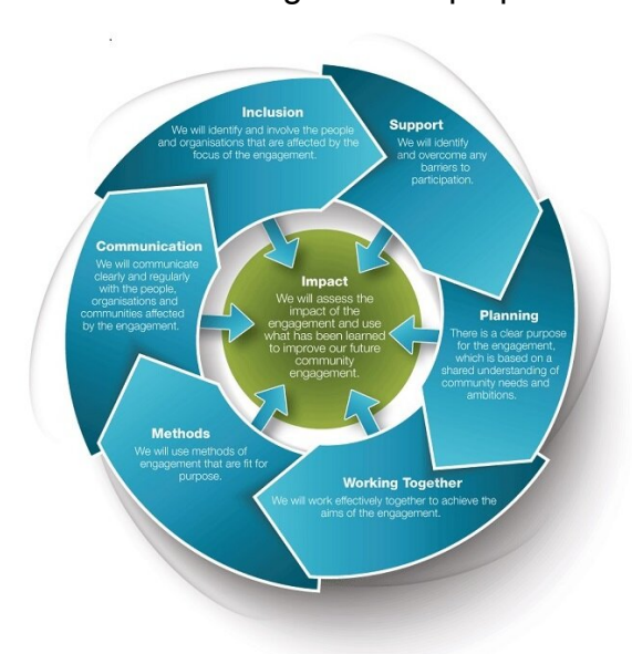
Figure 3 The National Standards for Community Engagement

As a key stakeholder in the process, we will also ensure that Community Councils are kept informed and involved at all stages of the preparation of the plan.