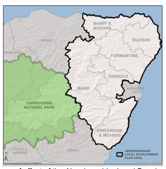
Figure 1 Area of effect of the Aberdeenshire Local Development Plan

The Local Development Plan covers the whole of Aberdeenshire, except that part within the Cairngorms National Park. They have their own Local Development Plan.