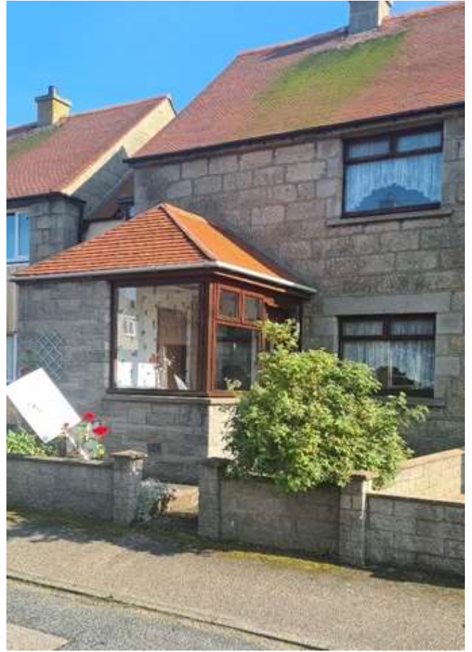
Alternative View of Front of Property