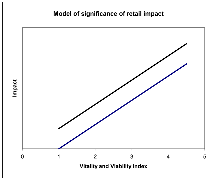
Figure 3 Model of significance of retail impact.

3.39. If the impact of a proposal is high, the significance of that impact will be much greater for a centre with a below average index of vitality and viability. Similarly if the vitality and viability of a centre is high, it will take a relatively large impact to be significant. The significance of a given level of impact remains a professional judgement of the planning authority but this judgement will be influenced by the tolerance of the vitality of a centre to retail impact as indicated by the health-check. As a general “rule of thumb” it is considered that a centre with an average vitality may be able to tolerate a diversion of up to 10% of its existing turnover without affecting its ability to continue to attract investment.