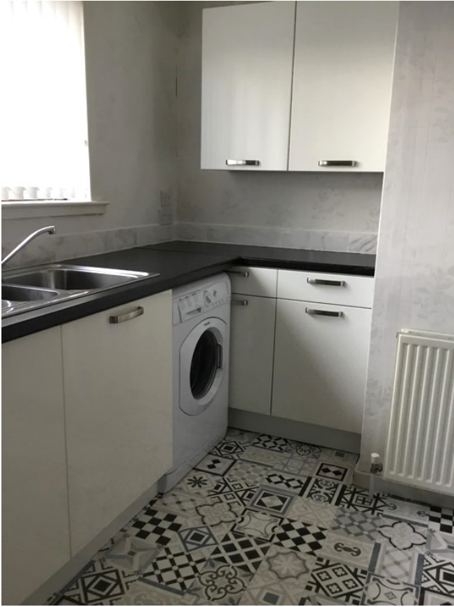
Alternative View of Kitchen