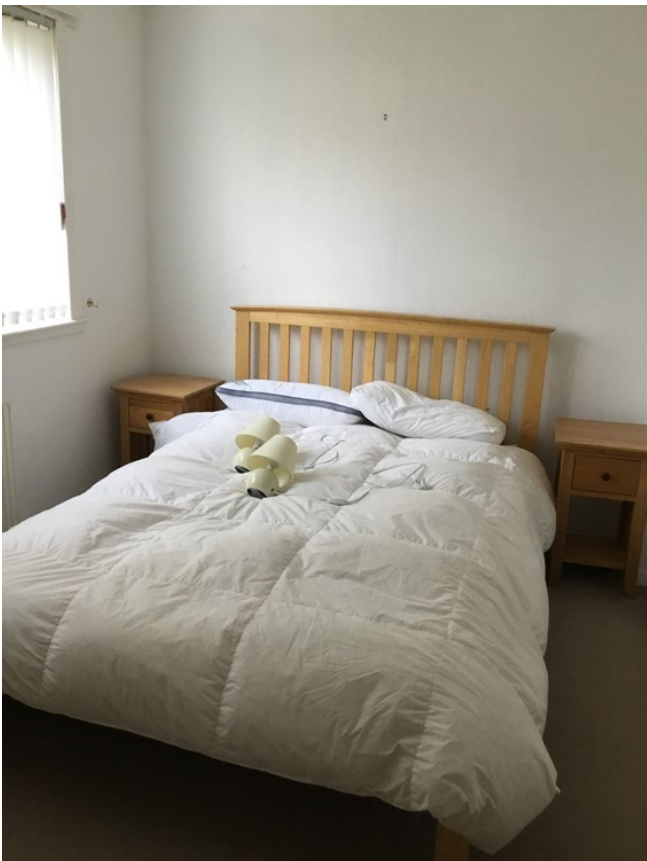
Alternative View of Bedroom 1