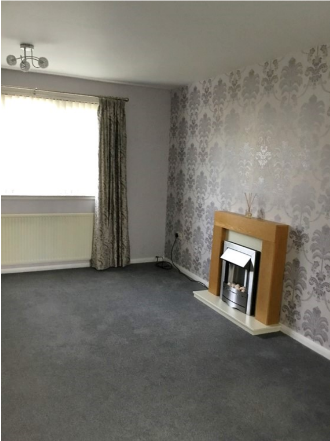
Alternative View of Living Room