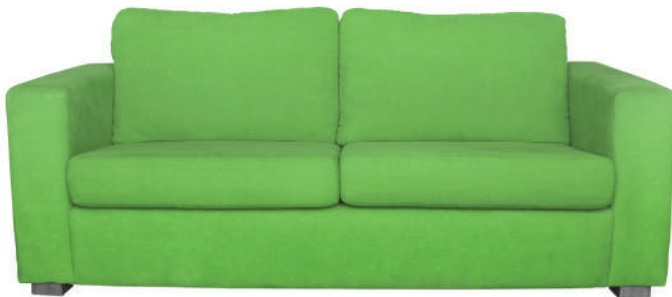
Furniture is a great example of what can be re-used.