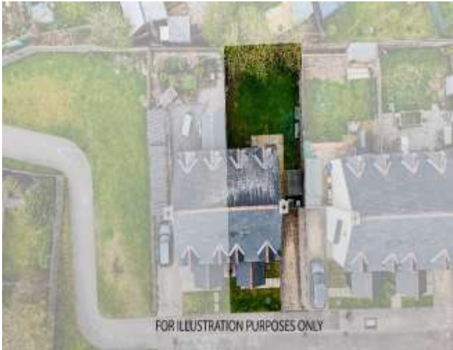
View of Surrounding Area